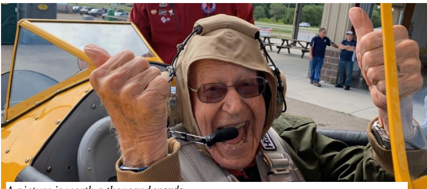
A picture is worth a thousand words...